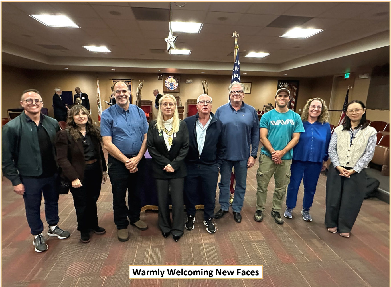
Warmly Welcoming New Faces

For the 2026-27 Membership Year athletic guest fees will be $20.00 per adult. This fee is in place for both non-athletic members and guests of the lodge. Every adult guest pass will include complimentary access for up to two children. A $5.00 fee will apply for any additional children visiting as guests of the lodge.